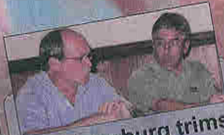
Stantonsburg trims drainage project ... Page B-8