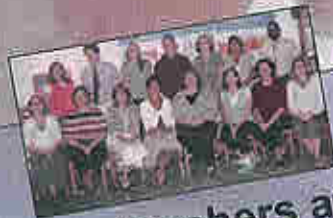
New teachers at Norwayne ...Page A-3